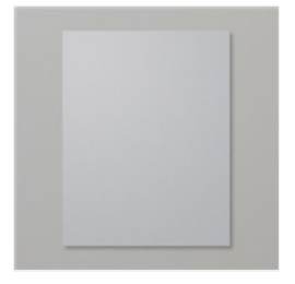
Smoky Slate 8-1/2" X 11" Cardstock -131202