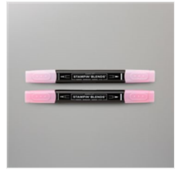
Flirty Flamingo Stampin' Blends Combo Pack -154884