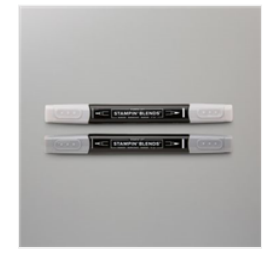
Smoky Slate Stampin' Blends Combo Pack -154904