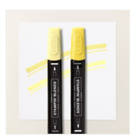
Lemon Lolly Stampin' Blends Combo Pack -161673