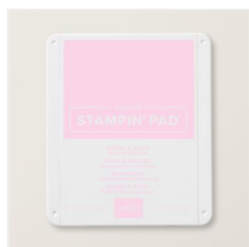
Bubble Bath Classic Stampin' Pad - 161664