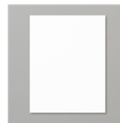
Basic White 8-1/2" X 11" Cardstock - 159276