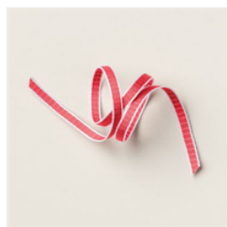
Sweet Sorbet 1/4" (6.4 Mm) Bordered Ribbon - 162558