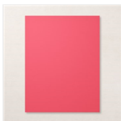
Sweet Sorbet 8- 1/2" X 11" Cardstock - 159268