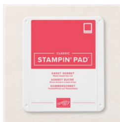
Sweet Sorbet Classic Stampin' Pad - 159216