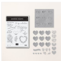
Adoring Hearts Bundle (English) - 162570