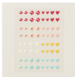
Adhesive-Backed Hearts & Flowers - 162557