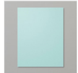
Pool Party 8-1/2" X 11" Cardstock - 122924