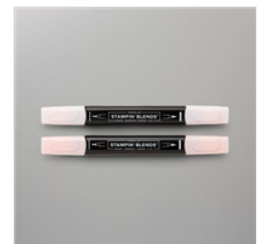
Petal Pink Stampin' Blends Combo Pack - 154893