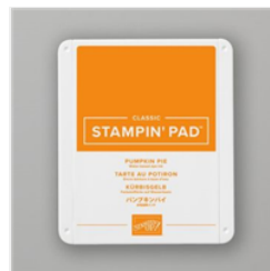
Pumpkin Pie Classic Stampin' Pad - 147086