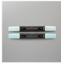
Pool Party Stampin' Blends Combo Pack - 154894