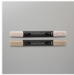
Crumb Cake Stampin' Blends Combo Pack - 154882