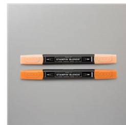
Pumpkin Pie Stampin' Blends Combo Pack - 154897