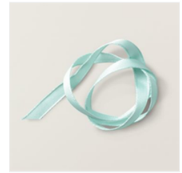
Pool Party 3/8" (1 Cm) Grosgrain Ribbon - 160430