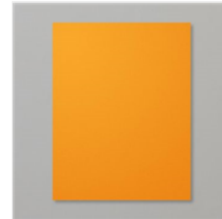
Pumpkin Pie 8-1/2" X 11" Cardstock - 105117