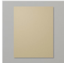
Crumb Cake 8-1/2" X 11" Cardstock - 120953