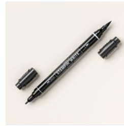
Basic Black Stampin' Write Marker - 162481