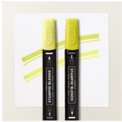
Lemon Lime Twist Stampin' Blends Combo Pack - 161682