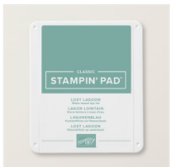
Lost Lagoon Classic Stampin' Pad - 161678