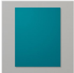
Pretty Peacock 8-1/2" X 11" Cardstock - 150880