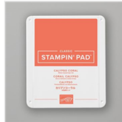
Calypso Coral Classic Stampin' Pad - 147101