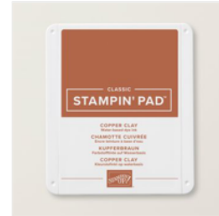
Copper Clay Classic Stampin' Pad - 161647