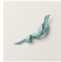
Lost Lagoon 1/4" (6.4 Mm) Bordered Ribbon - 161171