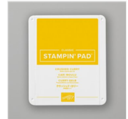
Crushed Curry Classic Stampin' Pad - 147087