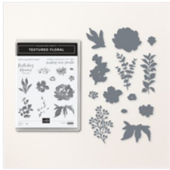
Textured Floral Bundle - 161232

Carol Buckalew inkybeestampers@gmail.com https://www.inkybeestampers.com