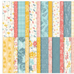
Inked Botanicals 6" X 6" (15.2 X 15.2 Cm) Designer Series Paper - 161157