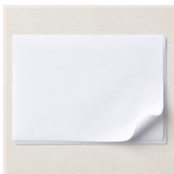
Stampin' Up! Masking Paper - 155480