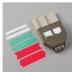
Banners Pick A Punch - 153608