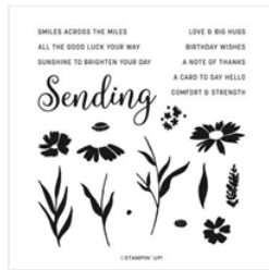
Sending Smiles Photopolymer Stamp Set (English) - 158701