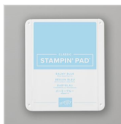
Balmy Blue Classic Stampin' Pad - 147105