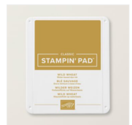
Wild Wheat Classic Stampin' Pad - 161651