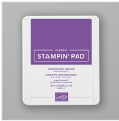
Gorgeous Grape Classic Stampin' Pad - 147099

Carol Buckalew inkybeestampers@gmail.com https://www.inkybeestampers.com