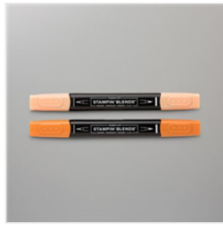
Pumpkin Pie Stampin' Blends Combo Pack - 154897