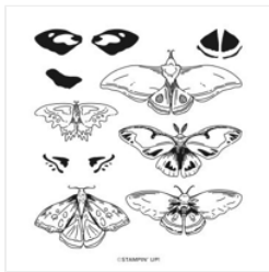
Night Of Flight Host Photopolymer Stamp Set - 161281

Carol Buckalew inkybeestampers@gmail.com https://www.inkybeestampers.com