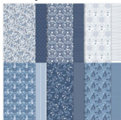
Countryside Inn 12" X 12" (30.5 X 30.5 Cm) Designer Series Paper - 161467