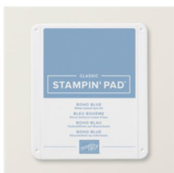
Boho Blue Classic Stampin' Pad - 161650