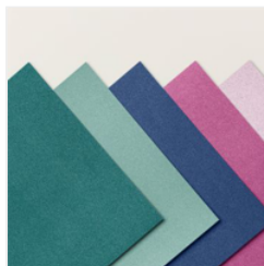
Soft Shimmer 12" X 12" (30.5 X 30.5 Cm) Specialty Paper - 161750