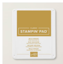
Wild Wheat Classic Stampin' Pad - 161651