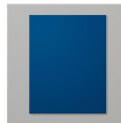
Night Of Navy 8- 1/2" X 11" Cardstock - 100867