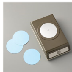
2" (5.1 Cm) Circle Punch - 133782