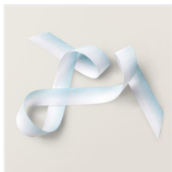
Balmy Blue/White 1/2" (1.3 Cm) Variegated Ribbon - 160448