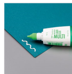
Multipurpose Liquid Blue - 110755