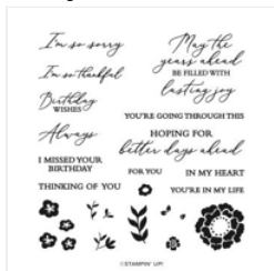
Lasting Joy Photopolymer Stamp Set (English) - 161442