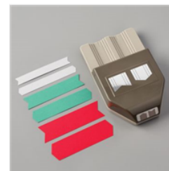
Banners Pick A Punch - 153608