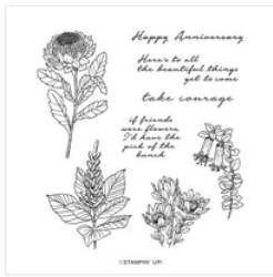
Everlasting Beauty Cling Stamp Set (English) - 161255