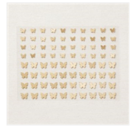
Brushed Brass Butterflies - 158136