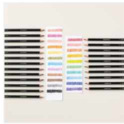
Watercolor Pencils Assortment 1 - 161700