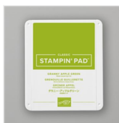
Granny Apple Green Classic Stampin' Pad - 147095