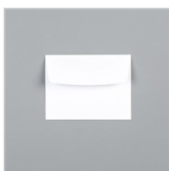
Basic White Medium Envelopes - 159236