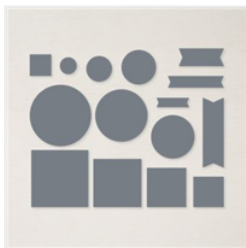
Stylish Shapes Dies - 159183