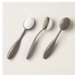
Blending Brushes - 153611