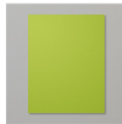
Granny Apple Green 8-1/2" X 11" Cardstock - 146990