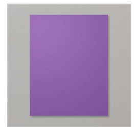
Gorgeous Grape 8-1/2" X 11" Cardstock - 146987