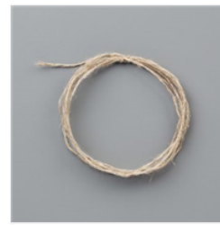
Linen Thread - 104199