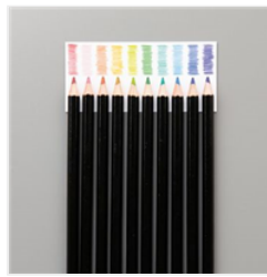
Watercolor Pencils Assortment 2 - 149014