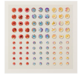
Iridescent Pastel Gems - 160429