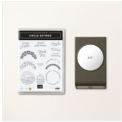
Circle Sayings Bundle (English) - 161355