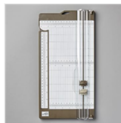
Paper Trimmer - 152392