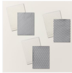
Basics 3D Embossing Folders - 161598