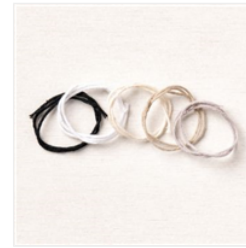
Baker's Twine Essentials Pack - 155475