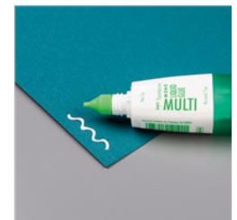
Multipurpose Liquid Glue - 110755