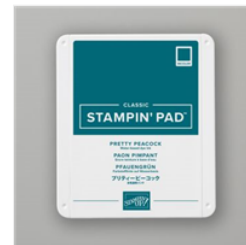
Pretty Peacock Classic Stampin' Pad - 150083