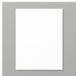
Basic White 8-1/2" X 11" Cardstock - 159276