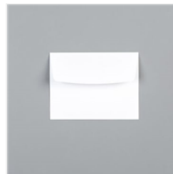
Basic White Medium Envelopes - 159236