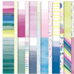
Bright & Beautiful 6" X 6" (15.2 X 15.2 Cm) Designer Series Paper - 161449