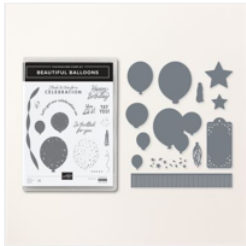
Beautiful Balloons Bundle (English) - 161457