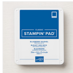
Blueberry Bushel Classic Stampin' Pad - 147138