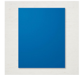
Blueberry Bushel 8-1/2" X 11" Cardstock - 146968