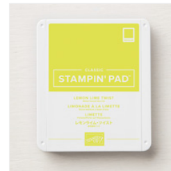
Lemon Lime Twist Classic Stampin' Pad - 147145