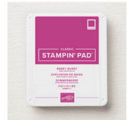
Berry Burst Classic Stampin' Pad - 147143