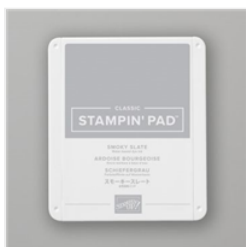
Smoky Slate Classic Stampin' Pad - 147113