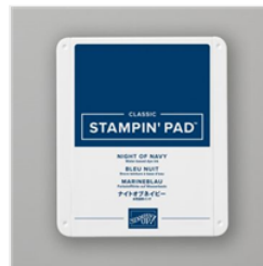
Night Of Navy Classic Stampin' Pad - 147110