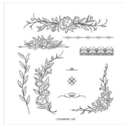
Decorative Borders Photopolymer Stamp Set - 160513