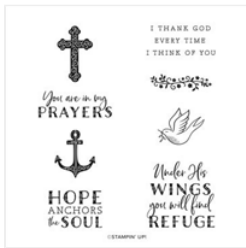
Hope & Prayer Cling Stamp Set (English) - 159009