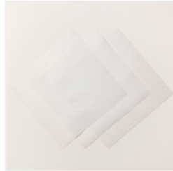
Vellum Basics 12" X 12" (30.5 X 30.5 Cm) Specialty Designer Series Paper - 160839