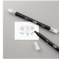
Blender Pens - 102845