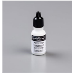
Whisper White Craft Stampin' Ink Refill - 101780