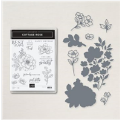
Cottage Rose Bundle (English) - 159048

inkybeestampers@gmail.com https://www.inkybeestampers.com