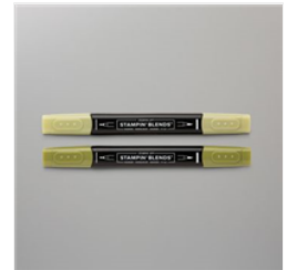
Old Olive Stampin' Blends Combo Pack - 154892