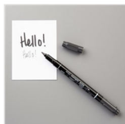
Basic Black Stampin' Write Marker - 100082