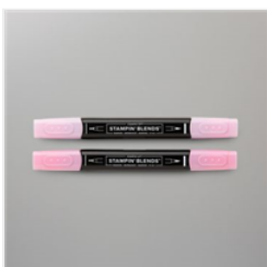
Flirty Flamingo Stampin' Blends Combo Pack - 154884