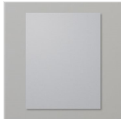
Smoky Slate 8-1/2" X 11" Cardstock - 131202