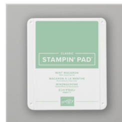
Mint Macaron Classic Stampin' Pad - 147106