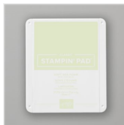
Soft Sea Foam Classic Stampin' Pad - 147102