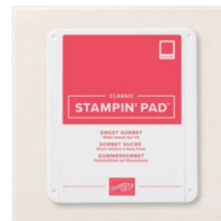
Sweet Sorbet Classic Stampin' Pad - 159216