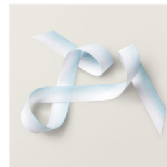
Balmy Blue/White 1/2" (1.3 Cm) Variegated Ribbon - 160448