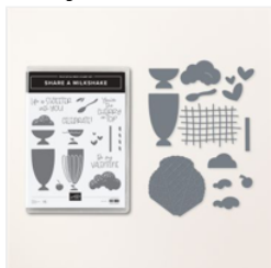
Share A Milkshake Bundle (English) - 160396