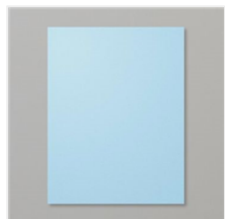
Balmy Blue 8-1/2" X 11" Cardstock - 146982