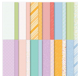
Dandy Designs 12" X 12" (30.5 X 30.5 Cm) Designer Series Paper - 160836