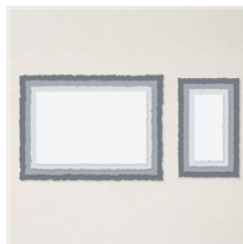
Deckled Rectangles Dies - 159173