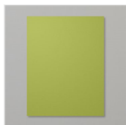
Old Olive 8-1/2" X 11" Cardstock - 100702