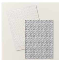
Cane Weave 3D Embossing Folder - 160580