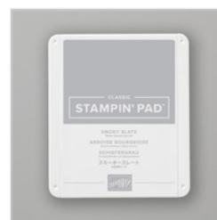
Smoky Slate Classic Stampin' Pad - 147113