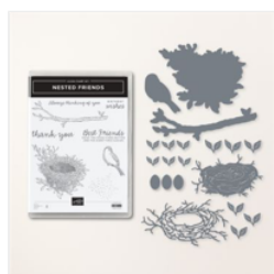
Nested Friends Bundle (English) - 160489