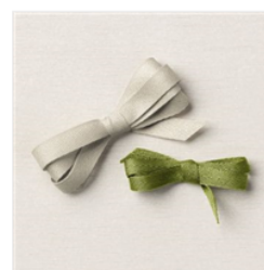
Old Olive & Sahara Sand Twill Ribbon Combo Pack - 158955