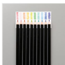
Watercolor Pencils Assortment 2 - 149014