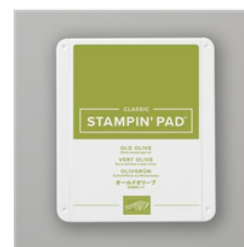
Old Olive Classic Stampin' Pad - 147090