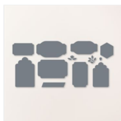
Something Fancy Dies - 160424