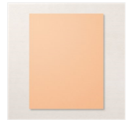
Pale Papaya 8-1/2" X 11" Cardstock - 155668