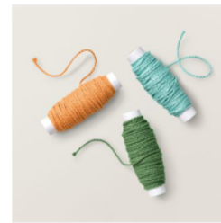
Three Twine Combo Pack - 160597