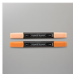
Pumpkin Pie Stampin' Blends Combo Pack - 154897