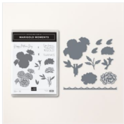
Marigold Moments Bundle (English) - 160667