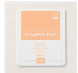
Pale Papaya Classic Stampin' Pad - 155670