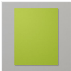
Granny Apple Green 8-1/2" X 11" Cardstock - 146990