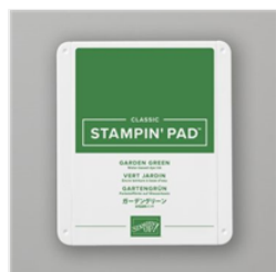
Garden Green Classic Stampin' Pad - 147089