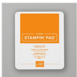
Pumpkin Pie Classic Stampin' Pad - 147086