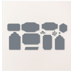
Something Fancy Dies - 160424