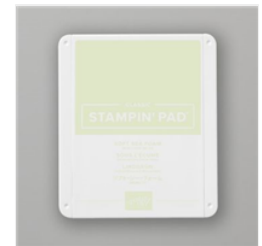
Soft Sea Foam Classic Stampin' Pad - 147102