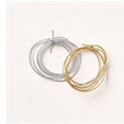
Simply Elegant Trim - 155766