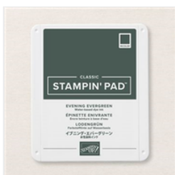
Evening Evergreen Classic Stampin' Pad - 155576