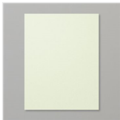
Soft Sea Foam 8- 1/2" X 11" Cardstock - 146988