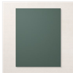
Evening Evergreen 8-1/2" X 11" Cardstock - 155574