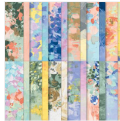
Fancy Flora 6" X 6" (15.2 X 15.2 Cm) Designer Series Paper - 160413