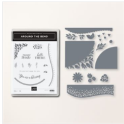
Around The Bend Bundle (English) - 162383