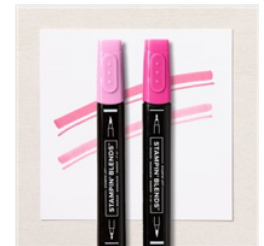
Polished Pink Stampin' Blends Combo Pack - 155520