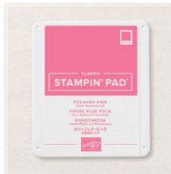
Polished Pink Classic Stampin' Pad - 155712