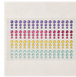
Glossy Dots Assortment - 158827