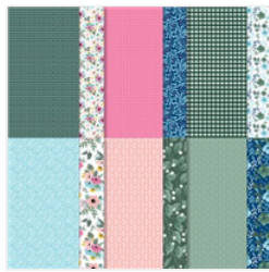
Fitting Florets 12" X 12" (30.5 X 30.5 Cm) Designer Series Paper - 161814