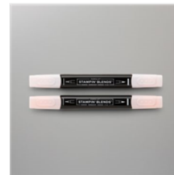
Petal Pink Stampin' Blends Combo Pack - 154893