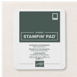
Evening Evergreen Classic Stampin' Pad - 155576