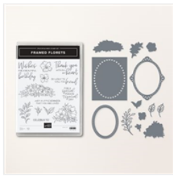
Framed Florets Bundle (English) - 162407