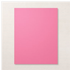
Polished Pink 8-1/2" X 11" Cardstock - 155710