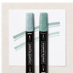
Soft Succulent Stampin' Blends Combo Pack - 155521