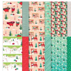
Santa Express 12" X 12" (30.5 X 30.5 Cm) Designer Series Paper - 159582