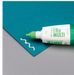
Multipurpose Liquid Glue - 110755