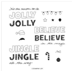
Jingle Jingle Jingle Photopolymer Stamp Set (English) - 153438