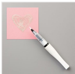
Wink Of Stella Clear Glitter Brush - 141897