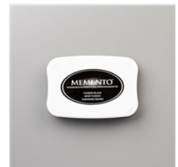
Tuxedo Black Memento Ink Pad - 132708