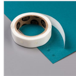
Mini Glue Dots - 103683