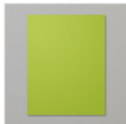
Granny Apple Green 8-1/2" X 11" Cardstock - 146990