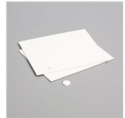
Stampin' Dimensionals - 104430