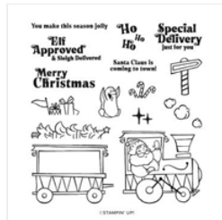
Santa's Delivery Photopolymer Stamp Set (English) - 159583