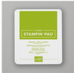
Granny Apple Green Classic Stampin' Pad - 147095