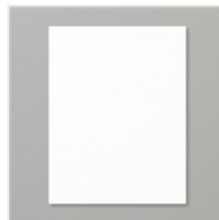
Basic White 8-1/2" X 11" Cardstock - 159276