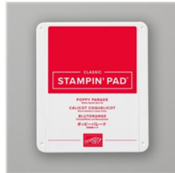
Poppy Parade Classic Stampin' Pad - 147050