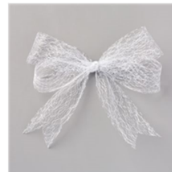
1-1/2" (3.8 Cm) Metallic Mesh Ribbon - 153550