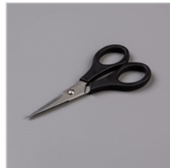
Paper Snips Scissors - 103579