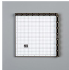
Stamparatus - 146276