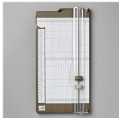
Paper Trimmer - 152392