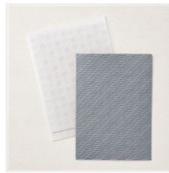
Gingham Embossing Folder - 157627