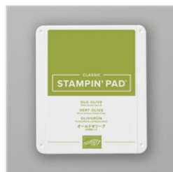
Old Olive Classic Stampin' Pad - 147090