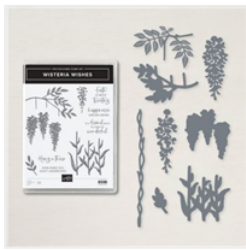
Wisteria Wishes Bundle (English) - 158860