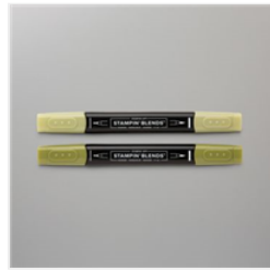
Old Olive Stampin' Blends Combo Pack - 154892