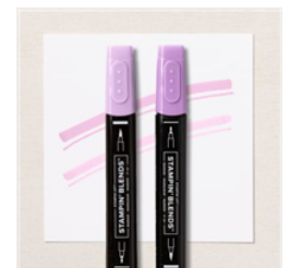
Fresh Freesia Stampin' Blends Combo Pack - 155518