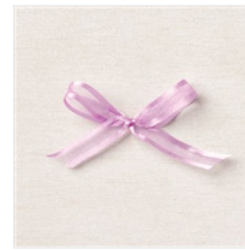
Fresh Freesia 3/8" (1 Cm) Open Weave Ribbon - 155615