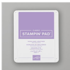
Highland Heather Classic Stampin' Pad - 147103