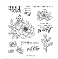
Cottage Rose Cling Stamp Set (English) - 159040