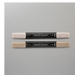
Crumb Cake Stampin' Blends Combo Pack - 154882