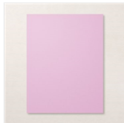
Fresh Freesia 8-1/2" X 11" Cardstock - 155613