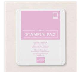
Fresh Freesia Classic Stampin' Pad - 155611