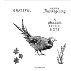
Painted Pheasant Cling Stamp Set (English) - 159846