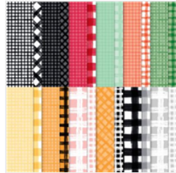
Gingham Cottage 12" X 12" (30,5 X 30,5 Cm) Designer Series Paper - 159651