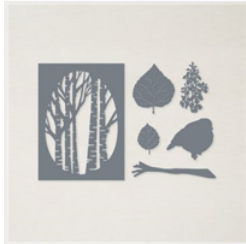
Aspen Tree Dies - 159798