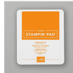
Pumpkin Pie Classic Stampin' Pad - 147086