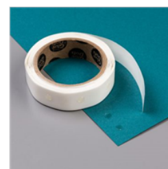
Mini Glue Dots - 103683