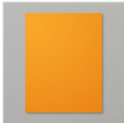
Pumpkin Pie 8-1/2" X 11" Cardstock - 105117