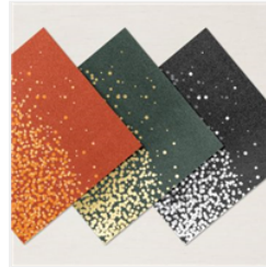
Metallic & Shimmer 6" X 6" (15.2 X 15.2 Cm) Specialty Paper - 159909