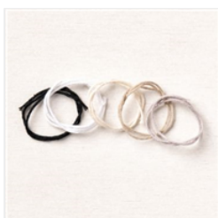
Baker's Twine Essentials Pack - 155475