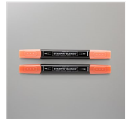
Cajun Craze Stampin' Blends Combo Pack - 154879