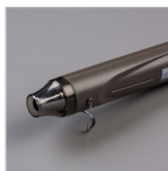
Heat Tool - 129053