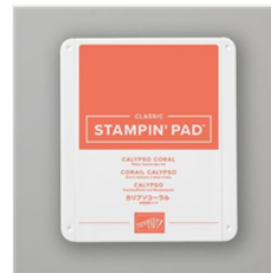
Calypso Coral Classic Stampin' Pad - 147101