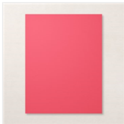
Sweet Sorbet 8-1/2" X 11" Cardstock - 159268