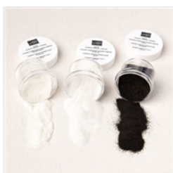
Basics Embossing Powders - 155554