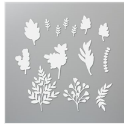
Forever Flourishing Dies - 152714