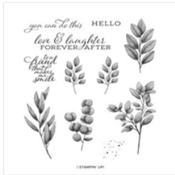
Forever Fern Cling Stamp Set (En) - 152559