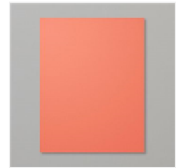
Calypso Coral 8-1/2" X 11" Cardstock - 122925