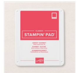
Sweet Sorbet Classic Stampin' Pad - 159216