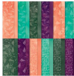
Pretty Prints 12" X 12" (30.5 X 30.5 Cm) Designer Series Paper - 159245