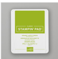
Granny Apple Green Classic Stampin' Pad - 147095