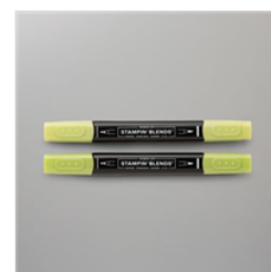
Granny Apple Green Stampin' Blends Combo Pack - 154885