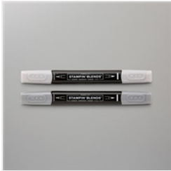
Smoky Slate Stampin' Blends Combo Pack - 154904