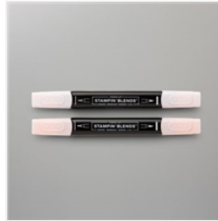
Petal Pink Stampin' Blends Combo Pack - 154893