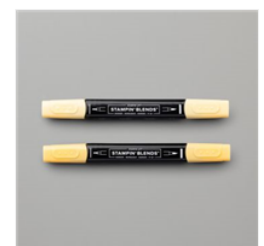
So Saffron Stampin' Blends Combo Pack - 154905