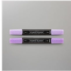
Highland Heather Stampin' Blends Combo Pack - 154887