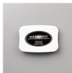
Tuxedo Black Memento Ink Pad - 132708