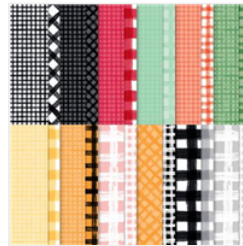
Gingham Cottage 12" X 12" (30,5 X 30,5 Cm) Designer Series Paper - 159651