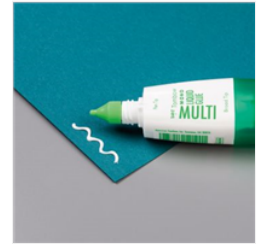
Multipurpose Liquid Glue - 110755