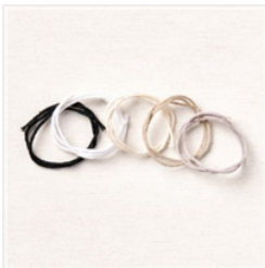
Baker's Twine Essentials Pack - 155475