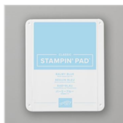
Balmy Blue Classic Stampin' Pad - 147105