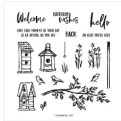
Garden Birdhouses Photopolymer Stamp Set - 155090