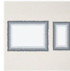
Deckled Rectangles Dies - 159173