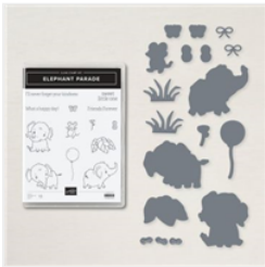
Elephant Parade Bundle (English) - 158697