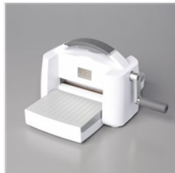
Stampin' Cut & Emboss Machine - 149653