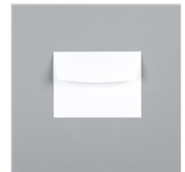
Basic White Medium Envelopes - 159236