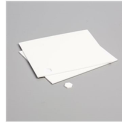
Stampin' Dimensionals - 104430