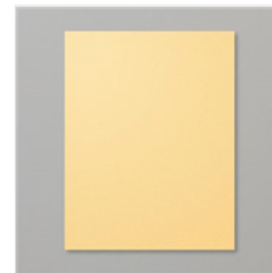
So Saffron 8-1/2" X 11" Cardstock - 105118