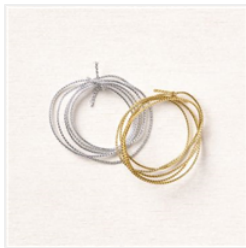
Simply Elegant Trim - 155766