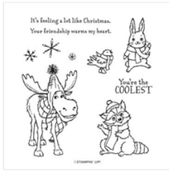
All Bundled Up Cling Stamp Set (English) - 159824

Carol Buckalew inkybeestampers@gmail.com https://www.inkybeestampers.com