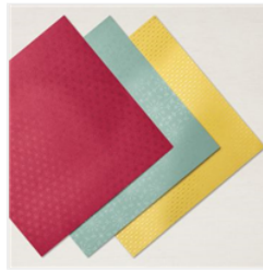
Festive Foils 12" X 12" (30.5 X 30.5 Cm) Specialty Designer Series Paper - 159536