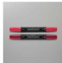
Cherry Cobbler Stampin' Blends Combo Pack - 154880