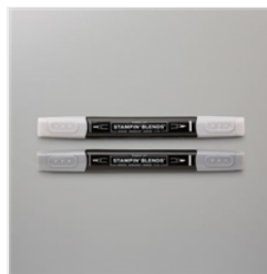
Smoky Slate Stampin' Blends Combo Pack - 154904