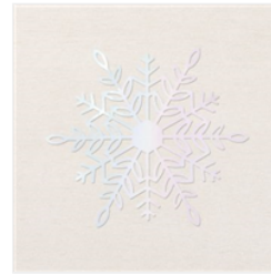
Wonderful Snowflakes - 156340