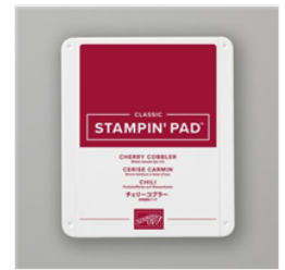
Cherry Cobbler Classic Stampin' Pad - 147083