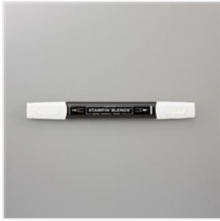
Stampin' Blends Color Lifter - 144608