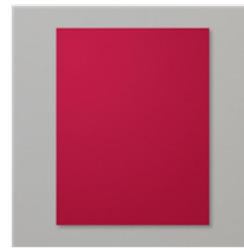
Cherry Cobbler 8-1/2" X 11" Cardstock - 119685