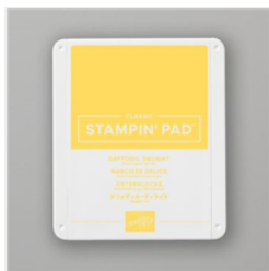
Daffodil Delight Classic Stampin' Pad - 147094