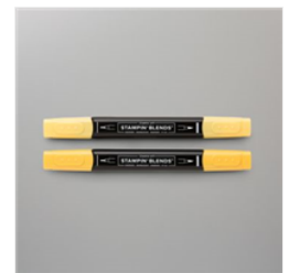
Daffodil Delight Stampin' Blends Combo Pack - 154883