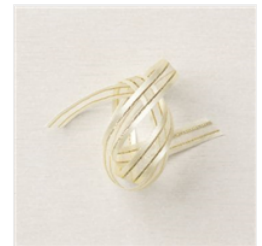
Gold & Vanilla 3/8" (1 Cm) Satin Edged Ribbon - 159555