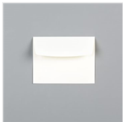
Very Vanilla Medium Envelopes - 107300