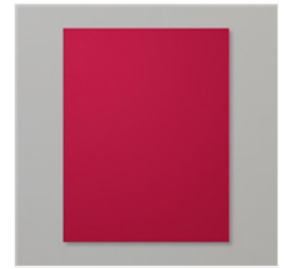
Cherry Cobbler 8-1/2" X 11" Cardstock - 119685