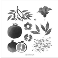
Perfect Pomegranate Host Photopolymer Stamp Set - 159899