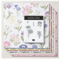
Wonderful World Bundle (English) - 159918