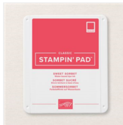
Sweet Sorbet Classic Stampin' Pad - 159216