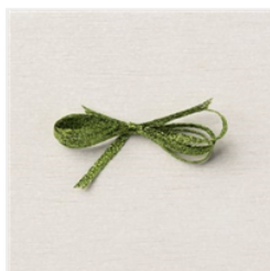
Parakeet Party 1/8" (3.2 Mm) Metallic Woven Ribbon - 159196