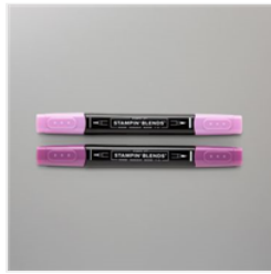
Blackberry Bliss Stampin' Blends Combo Pack - 154877