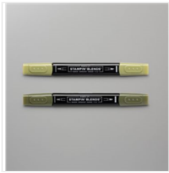
Mossy Meadow Stampin' Blends Combo Pack - 154890