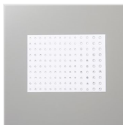
Rhinstone Basic Jewels - 144220