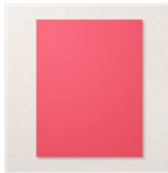
Sweet Sorbet 8- 1/2" X 11" Cardstock - 159268