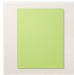
Parakeet Party 8- 1/2" X 11" Cardstock - 159259