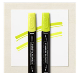
Parakeet Party Stampin' Blends Combo Pack - 159220