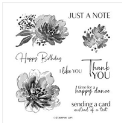
Flowing Flowers Cling Stamp Set - 157880