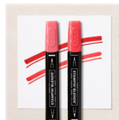
Sweet Sorbet Stampin' Blends Combo Pack - 159224