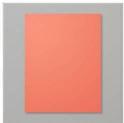
Calypso Coral 8-1/2" X 11" Cardstock - 122925