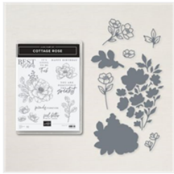
Cottage Rose Bundle (English) - 159048