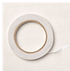
Tear & Tape Adhesive - 154031