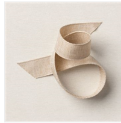
Natural Finish 7/8" (2.2 Cm) Ribbon - 159051