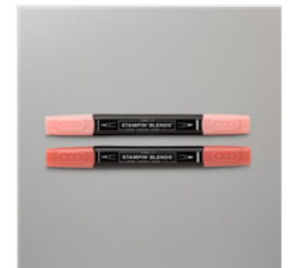
Calypso Coral Stampin' Blends Combo Pack - 154881