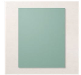
Soft Succulent 8-1/2" X 11" Cardstock - 155776