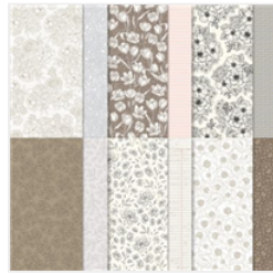
Abigail Rose 12" X 12" (30.5 X 30.5 Cm) Designer Series Paper - 159037