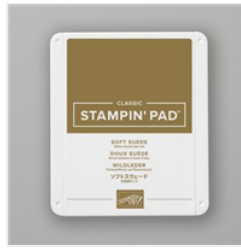
Soft Suede Classic Stampin' Pad - 147115