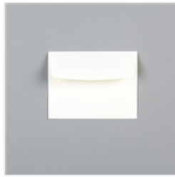
Very Vanilla Medium Envelopes - 107300