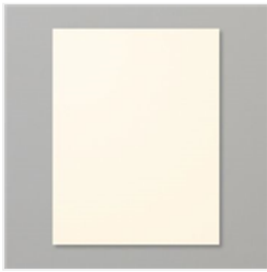
Very Vanilla 8-1/2" X 11" Cardstock - 101650

Carol Buckalew inkybeestampers@gmail.com https://www.inkybeestampers.com