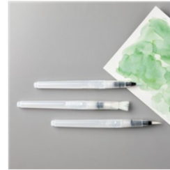
Water Painters - 151298