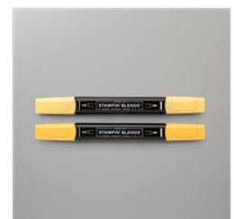
Daffodil Delight Stampin' Blends Combo Pack - 154883