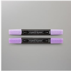
Highland Heather Stampin' Blends Combo Pack - 154887