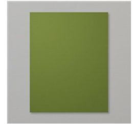
Mossy Meadow 8-1/2" X 11" Cardstock - 133676