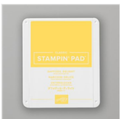
Daffodil Delight Classic Stampin' Pad - 147094