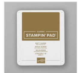
Soft Suede Classic Stampin' Pad - 147115