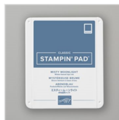
Misty Moonlight Classic Stampin' Pad - 153118