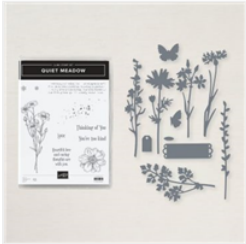
Quiet Meadow Bundle (English) - 155847