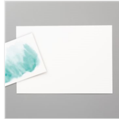
Fluid 100 Watercolor Paper - 149612