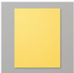
Daffodil Delight 8-1/2" X 11" Cardstock - 119683