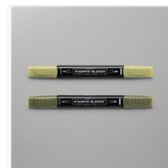
Mossy Meadow Stampin' Blends Combo Pack - 154890