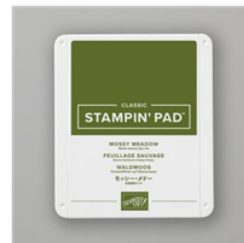
Mossy Meadow Classic Stampin' Pad - 147111