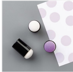
Sponge Daubers - 133773