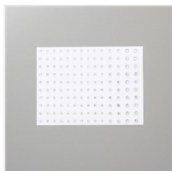
Rhinstone Basic Jewels - 144220