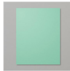
Coastal Cabana 8-1/2" X 11" Cardstock - 131297