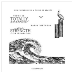
Waves Of Inspiration Cling Stamp Set (English) - 158833

Carol Buckalew inkybeestampers@gmail.com https://www.inkybeestampers.com