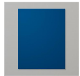
Night Of Navy 8-1/2" X 11" Cardstock - 100867