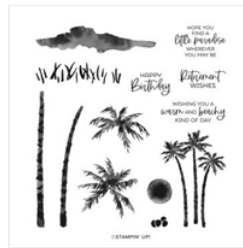
Paradise Palms Cling Stamp Set (English) - 157716