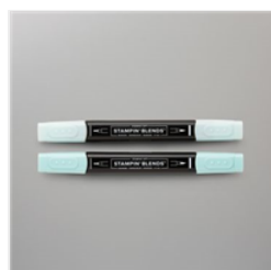
Pool Party Stampin' Blends Combo Pack - 154894