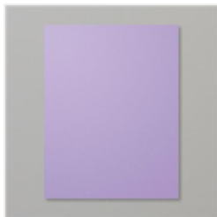
Highland Heather 8-1/2" X 11" Cardstock - 146986