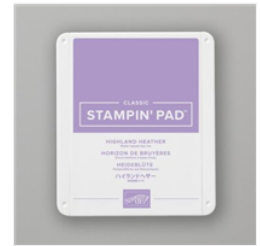
Highland Heather Classic Stampin' Pad - 147103