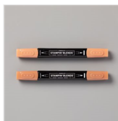
Cinnamon Cider Stampin' Blends Combo Pack - 153105