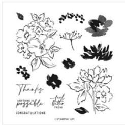
Hand-Penned Petals Photopolymer Stamp Set - 155070