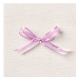
Fresh Freesia 3/8" (1 Cm) Open Weave Ribbon - 155615