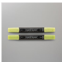
Granny Apple Green Stampin' Blends Combo Pack - 154885