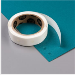
Mini Glue Dots - 103683