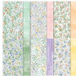
Hand-Penned 12" X 12" (30.5 X 30.5 Cm) Designer Series Paper - 155499